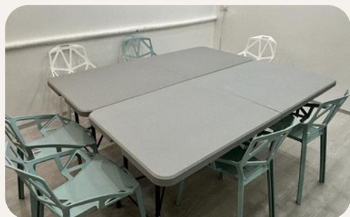
可疊式枱 180x 74cm