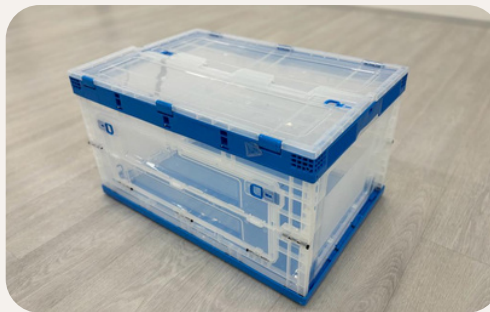
Storage Small: 53x 36x 31 (H)cm Large: 64x 43x 35(H)cm