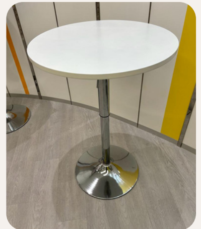
Round bar table 60x 60cm 60-90(H)cm (Adjustable)

For inquiries and reservations: 21997576/ WhatsApp 95379380/ contact@innoagehub.com