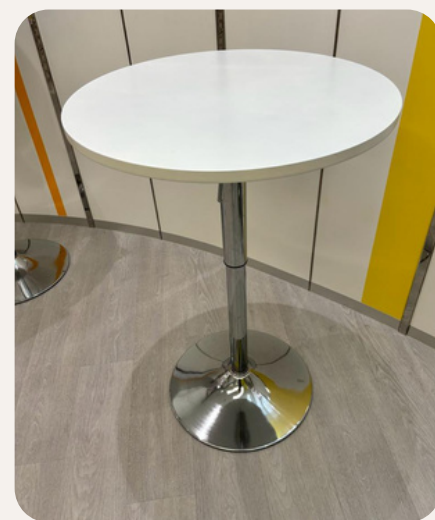
圓高枱 60x 60cm 60-90(H)cm 可調教